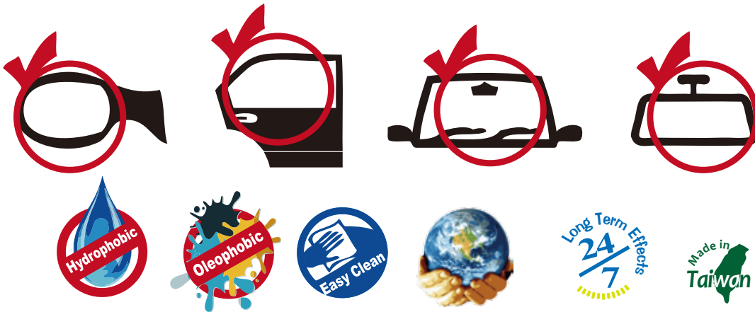
Hydrophobic Oleophobic Easy Clean Eco Friendly Long Time Effect